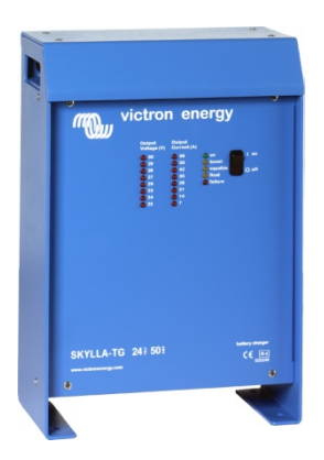
Skylla Charger 24 V 50 A