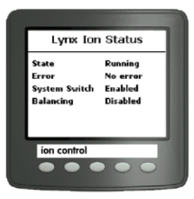
Ion control: Lynx Ion Status