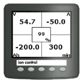
Ion control: Main screen