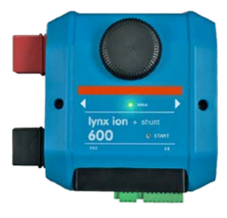
Lynx Ion + Shunt